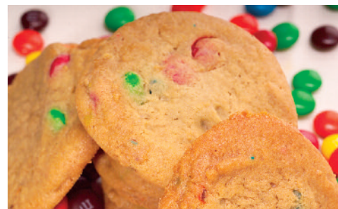
461 M&M® CANDY DULCES M&M®