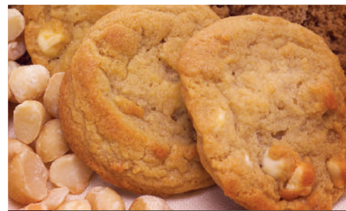
465 WHITE CHOCOLATE MACADAMIA NUT