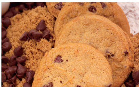
460 CHOCOLATE CHIP CHISPAS DE CHOCOLATE

The taste of homemade without the messy kitchen. Dough is preportioned. Zero grams of trans fat per serving.