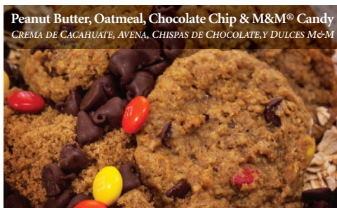
467 MONSTER COOKIES GALLETAS MONTRUO